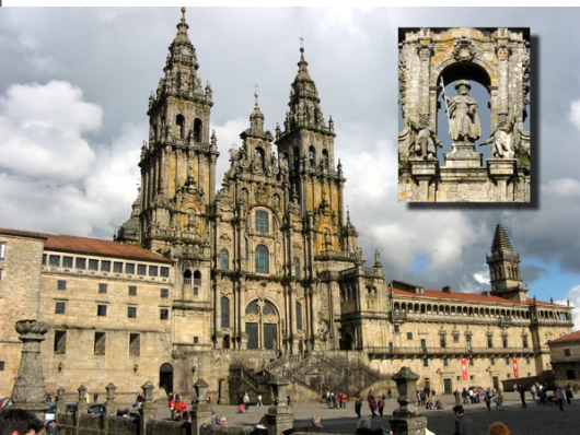
The Cathedral in Santiago. The inset shows a detail of a statue of the Apostle above the main doors.

There are many routes to Compostela, but the best known is the "French Route", which begins at the Roncesvalles Pass over the Pyrenees and goes through Pamplona, Burgos, and Leon, until it reaches Santiago some 800 km later. This is the route that the French pilgrims took on the way to the tomb of the Apostle and it has many churches and monasteries along the way that catered to the needs of the pilgrims over the centuries.